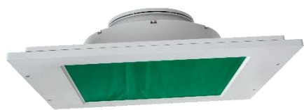
SM-140 WaveFinder – stand-alone sensor for motion compensated wave monitoring

The FMCW (Frequency Modulated Continuous Wave) microwave sensor accurately measures the distance to the water surface and heave. Draught is calculated relative to a user defined reference level. Wave variables are calculated both from the motion compensated wave point spectrum and from time-series analysis 1 .