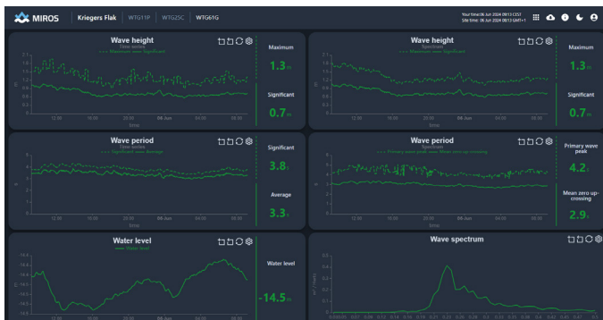
Miros Cloud dashboard example, public site on miros.app.